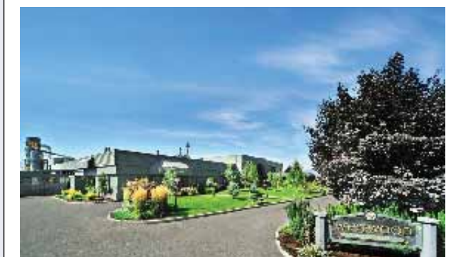
Westwood Fine Cabinetry's manufacturing plant and showroom.

2477 Main Street West, Kelowna • P. 250.768.7353 www.jkschmidt.ca