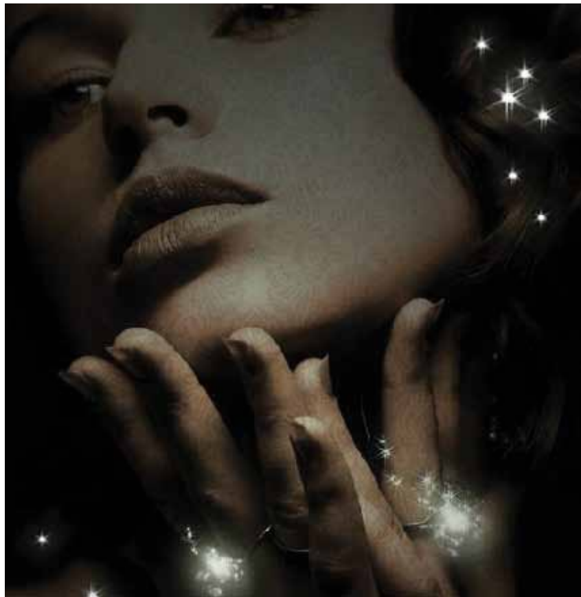
Every woman dreams about diamonds.

spincaster PRODUCTIONS INC. 100-1751 Harvey Avenue, Kelowna P. 250.763.6952 TF. 877.247.9977 www.spincaster.com