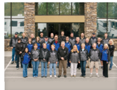
Country RV team.