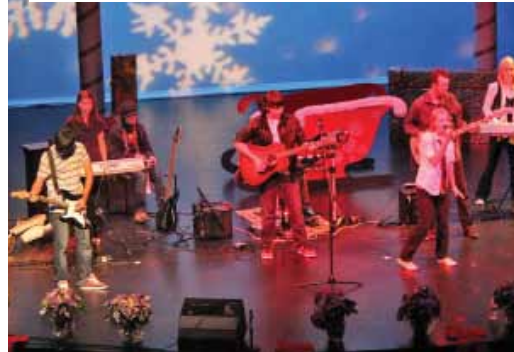
Top: The Elementary Dance Class poses as they get ready for their December performance. Bottom: The Senior Rock Band performs for 300 people at Rotary Centre for the Arts, December 7, 2012