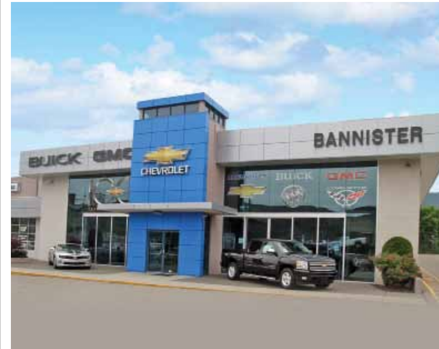
Come visit our Bannister GM dealership in Vernon.

Wilden Skylands showhome at 139 Skyland Drive, Kelowna P. 250.491.7690 • www.authentechhomes.com