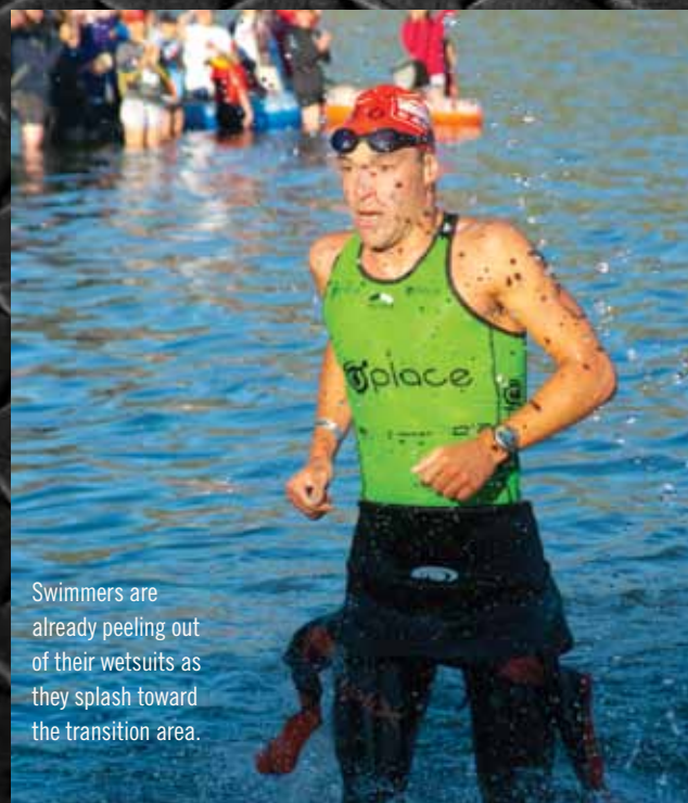
Swimmers are already peeling out of their wetsuits as they splash toward the transition area.