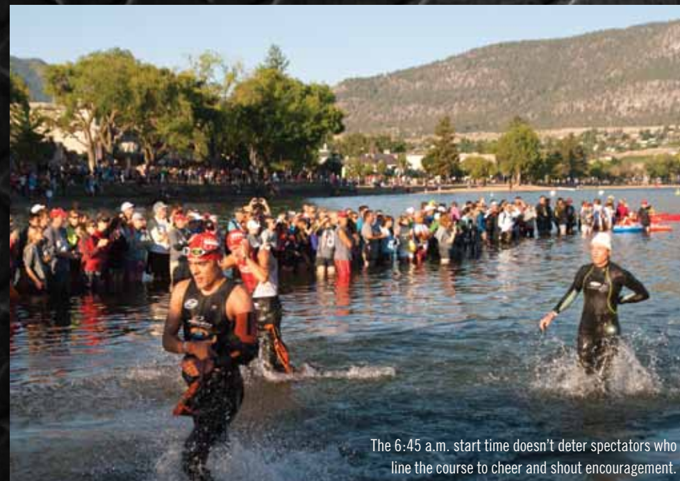
The 6:45 a.m. start time doesn't deter spectators who line the course to cheer and shout encouragement.