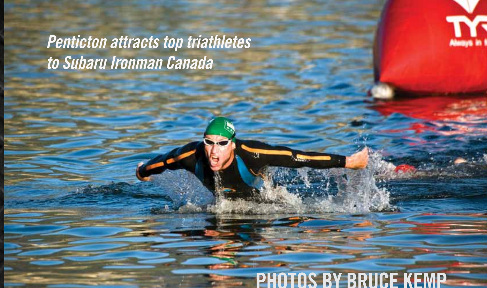
Penticton attracts top triathletes to Subaru Ironman Canada