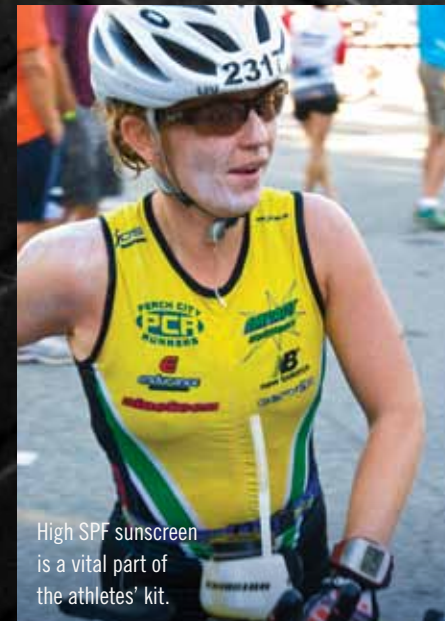
High SPF sunscreen is a vital part of the athletes' kit.