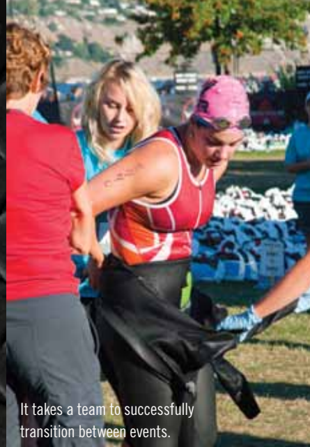
It takes a team to successfully transition between events.