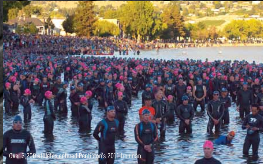
Over 3,200 athletes entered Penticton's 2011 Ironman.