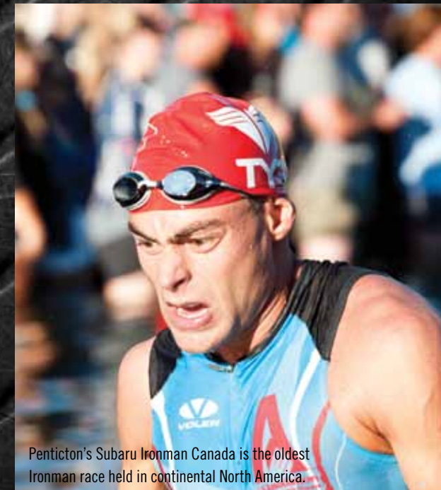
Penticton's Subaru Ironman Canada is the oldest Ironman race held in continental North America.