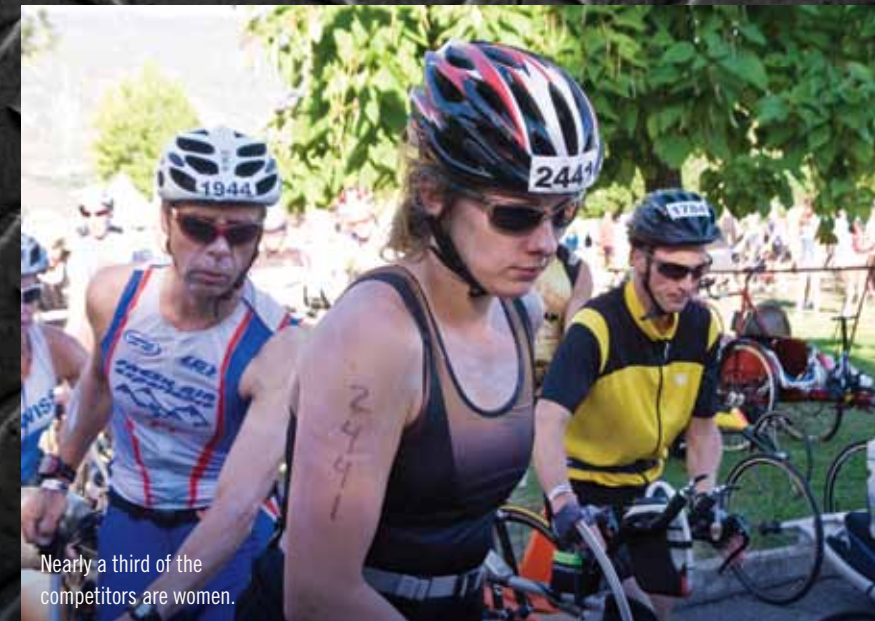
Nearly a third of the competitors are women.