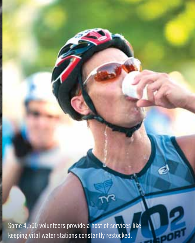
Some 4,500 volunteers provide a host of services like keeping vital water stations constantly restocked.