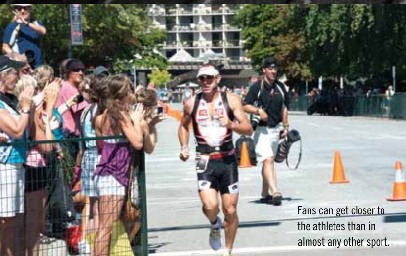
Fans can get closer to the athletes than in almost any other sport.