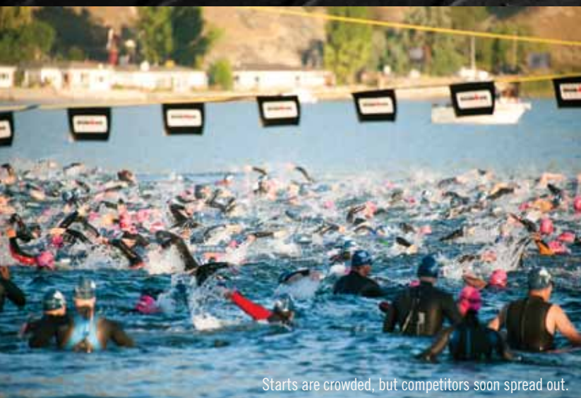
Starts are crowded, but competitors soon spread out.