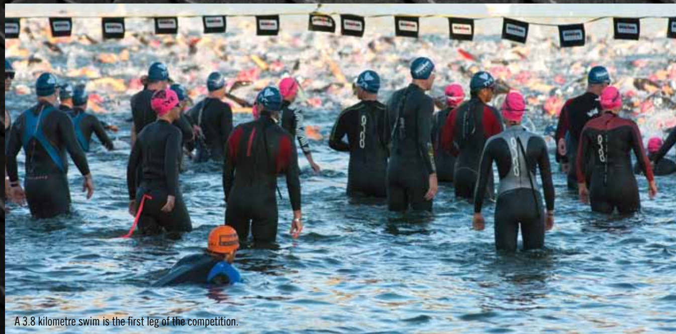
A 3.8 kilometre swim is the first leg of the competition.